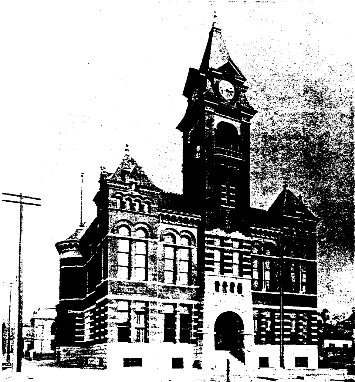
New Hanover County Courthouse, 1876