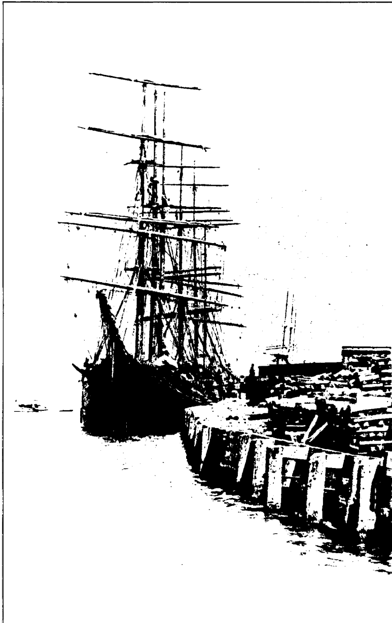
The Port of Wilmington, 1895

Journal of the Old New Hanover Genealogical Society