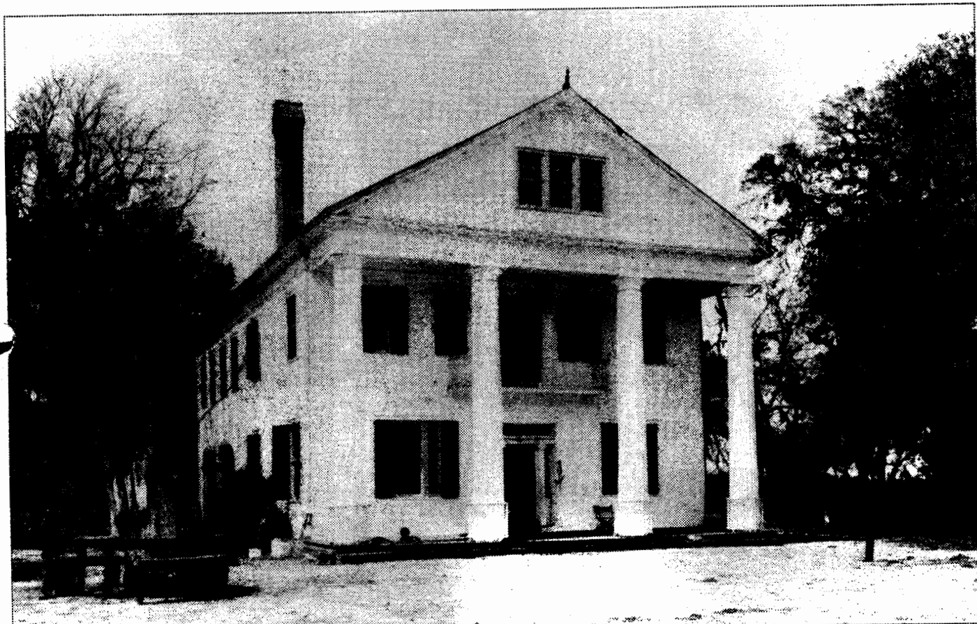
Orton Plantation in Brunswick County, 1895

Journal of the Old New Hanover Genealogical Society