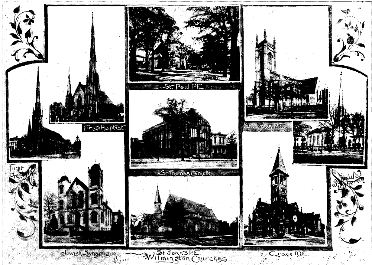
Souvenir of Wilmington, North Carolina 1903