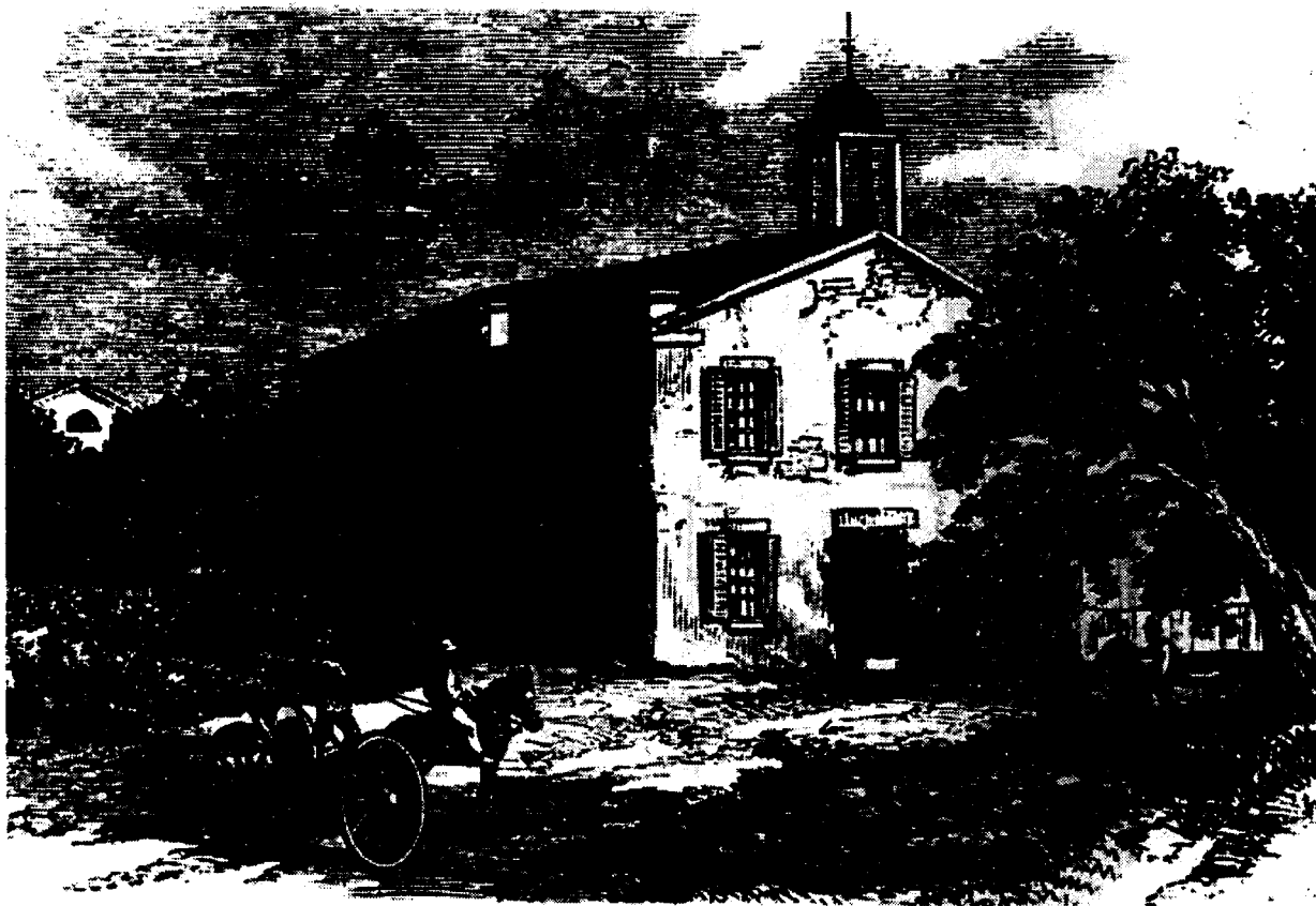
Courthouse at Southport (Smithville), February, 1865

Journal of the Old New Hanover Genealogical Society